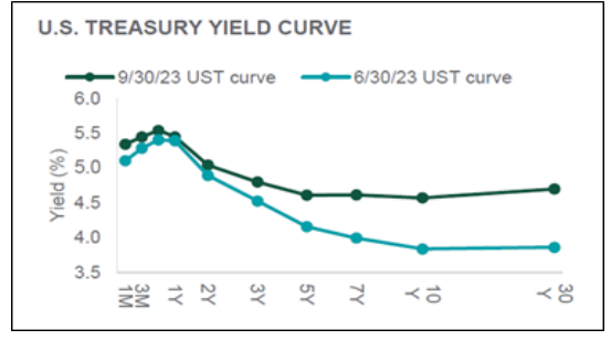
Figure 2- Source: Northern Trust Asset Management

bout 4.6% — its highest rate since the onset of the financial crisis in 2007. Thus, the new expectation is that interest rates will be "higher for longer" than previously thought.